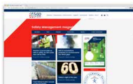
Safety Management website

The website brings together news, views and opinions about health, safety and environmental management all in one place. It is updated daily basis.