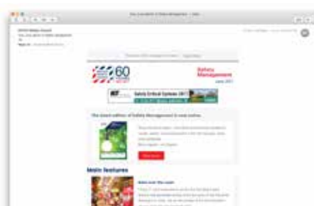
Safety Management e-newsletter

The monthly Safety Management e-newsletter informs on the most relevant health, safety and environmental topics of the month and includes some of the features from the print magazine. Register for free.