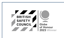
BW on white